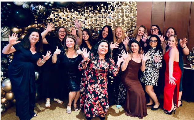
GACS Staff gather for a group shot at the end of a successful evening of fundraising