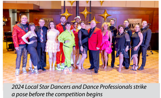
2024 Local Star Dancers and Dance Professionals strike a pose before the competition begins