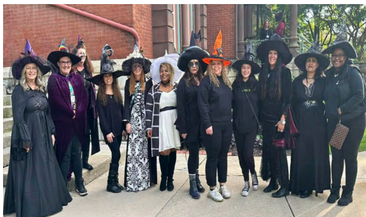
GACS staff volunteering as the "Gatekeepers" at Witches Night Out 2023

Every year during October: Domestic Violence Awareness Month (DVAM), GACS participates in many awareness events and activities. October 2023 was an extra special year as our Groundwork Program celebrated it's 40th Anniversary. We had a successful awareness month, hosting and participating in a variety of events including: Will County Take Back the Night, Grundy County Take Back the Night, Witches Night Out, and our Angels Against Abuse 5K.