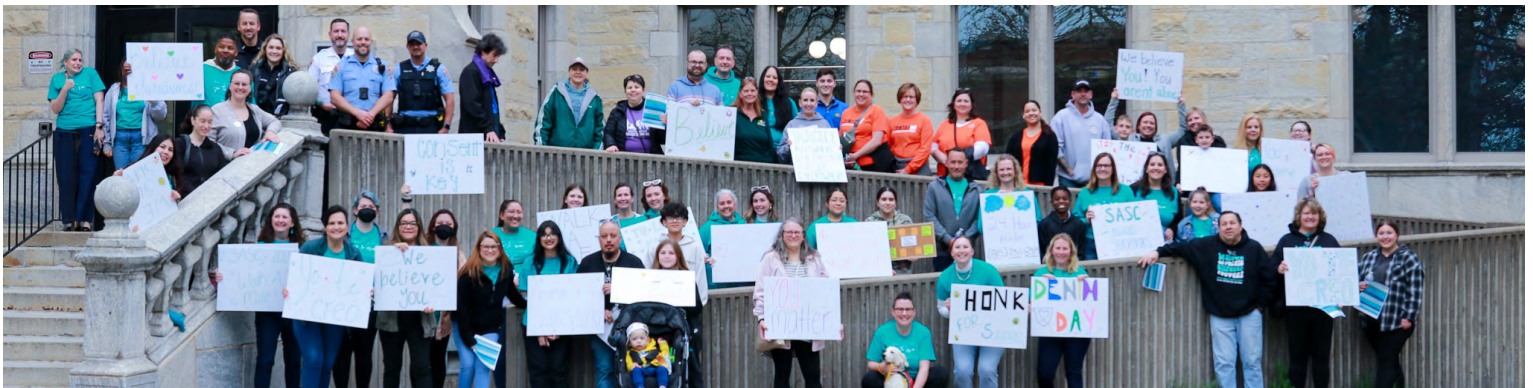
Walk a Mile attendees gather for a group photo before beginning the mile-long march in Downtown Joliet

The month of awareness activities concluded with Denim Day, celebrated on April 24, 2024. For the past 25 years, Peace Over Violence has run its Denim Day campaign on a Wednesday in April in honor of Sexual Violence Awareness Month. The campaign was originally triggered by a ruling by the Italian Supreme Court where a rape conviction was overturned because the justices felt that since the victim was wearing tight jeans she must have helped her rapist remove her jeans, thereby implying consent ( peaceoverviolence.org ). On this day, allies of the cause are encouraged to wear denim to show their support. More information on the annual awareness events and Sexual Assault Awareness Month can be found at gacsprograms.org/saam .