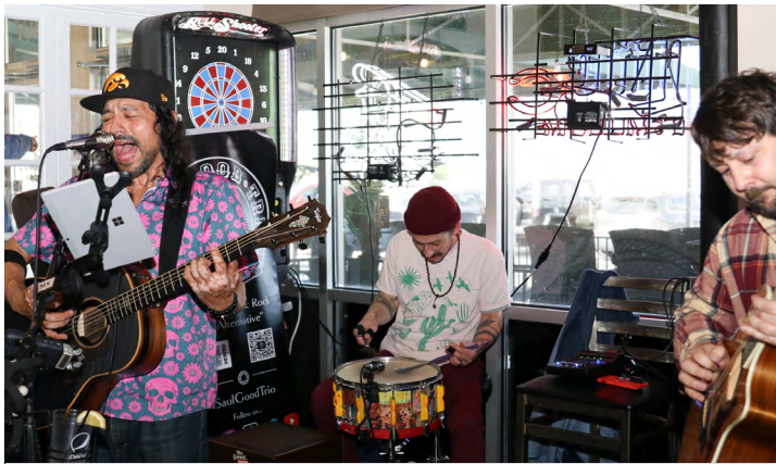
Saul Good Trio performs at "Songs for Survivors" on April 12